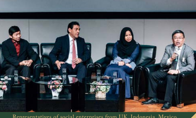
Representatives of social enterprises from UK, Indonesia, Mexico communicated in the sSummit